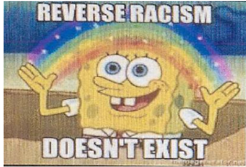
Compl Ex A. p. 9

1 2 3 4 5 6 7 8 9 10 11 12 13 14 15 16 17 18 19 20 21 22 23 24 25 26 27 28