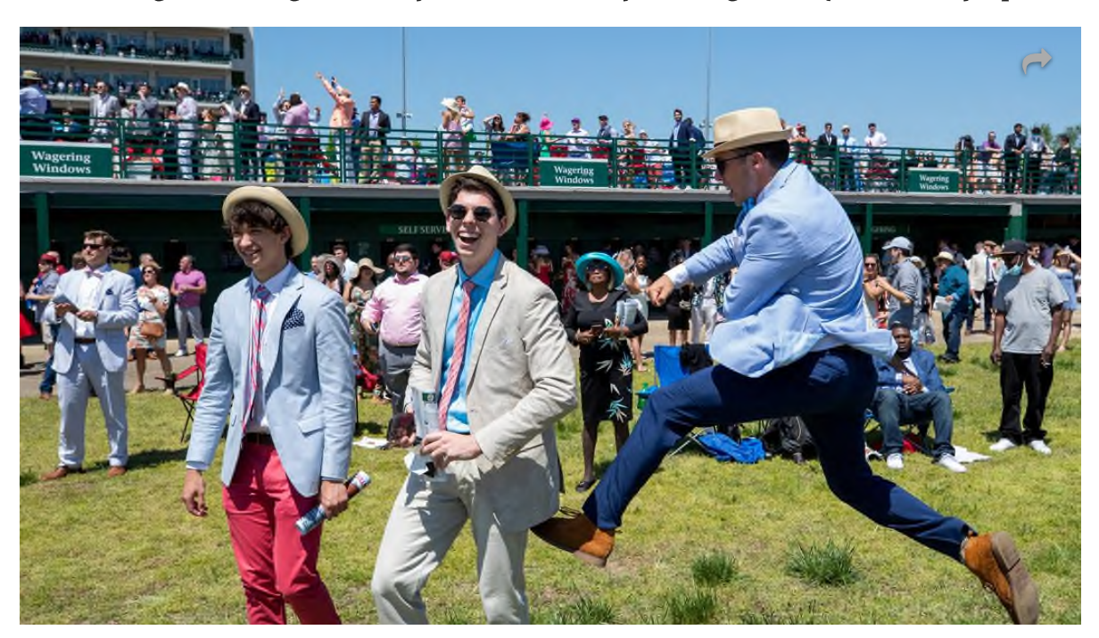
Fans fill Churchill Downs, but not quite packed as usual for the 147th running of the Kentucky Derby. The track was at 40-50% normal capacity due to the COVID-19 pandemic.

More importantly, what does this mean for horse racing? Just once in Kentucky Derby history has the winner been disqualified for a positive drug test. That was in 1968 with Dancer's Image. Runner-up Forward Pass was declared the winner. But a series of legal challenges lasted years until finally the original DQ was finally upheld.