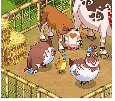
No.1 Farm Game of 2020, No Need to Download. Play now