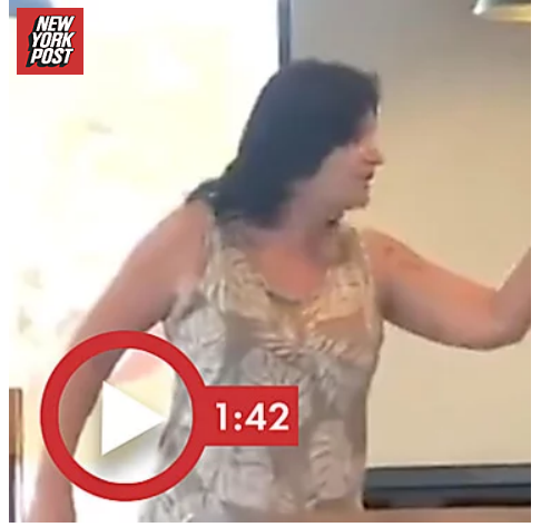
New York Post

Taco Bell 'Karen' goes ballistic on employees over burrito order