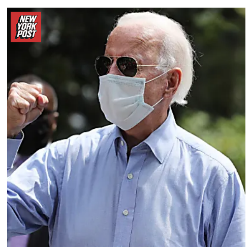
New York Post

Taco Bell 'Karen' goes ballistic on employees over burrito order