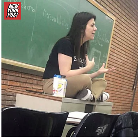
New York Post

Joe Biden threatens 'personal price' if business leaders oppose attempts to unionize