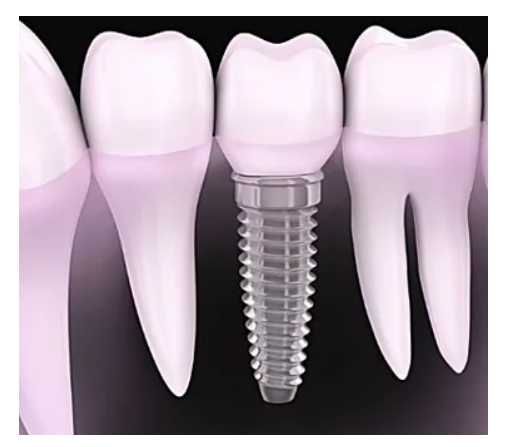
Here's What New Dental Implants Should Cost in 2020

Sponsored: Dental Implants | Sponsored Listings