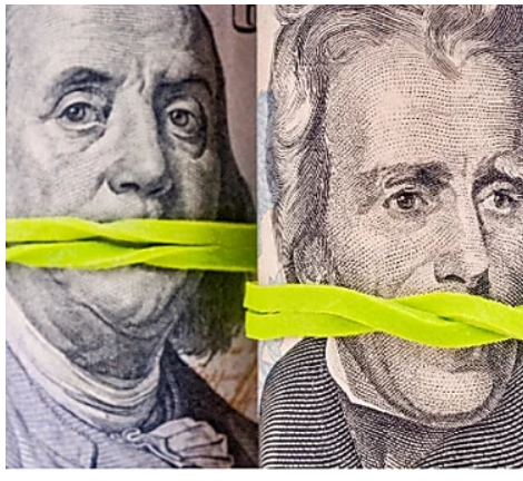
Read This Before You Renew Amazon Prime Again

Sponsored: Dental Implants | Sponsored Listings